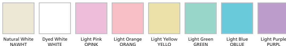
Natural White NAWHT

Available in eight 'glow in the dark' shades, Lucence will brighten any embroidered garment.